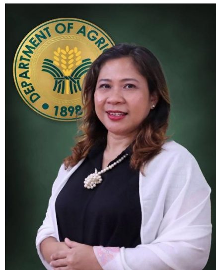
Usec. Cheryl-Marie Natividad Caballero Department of Agriculture Government of The Philippines